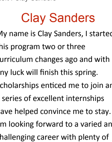
Left : Clay Sanders